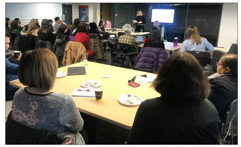
Inaugural meeting of the research cluster on Critical Perspectives on Mental Health/Mad Studies, York University, February 2020.

This societal recognition of mental health has arguably helped to reduce the stigma associated with mental distress. However, it has done very little to shift the paradigm away from understanding mental distress through the lens of biomedicine and the psychological sciences, or to create policies and resources to help address the many