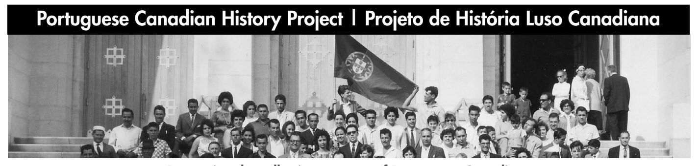
Preserving the collective memory of Portuguese Canadians Democratizing access to historical knowledge https://pchpblog.wordpress.com | Twitter @PCHP_PHLC

Colonialism vs. truth and reconciliation, page 34