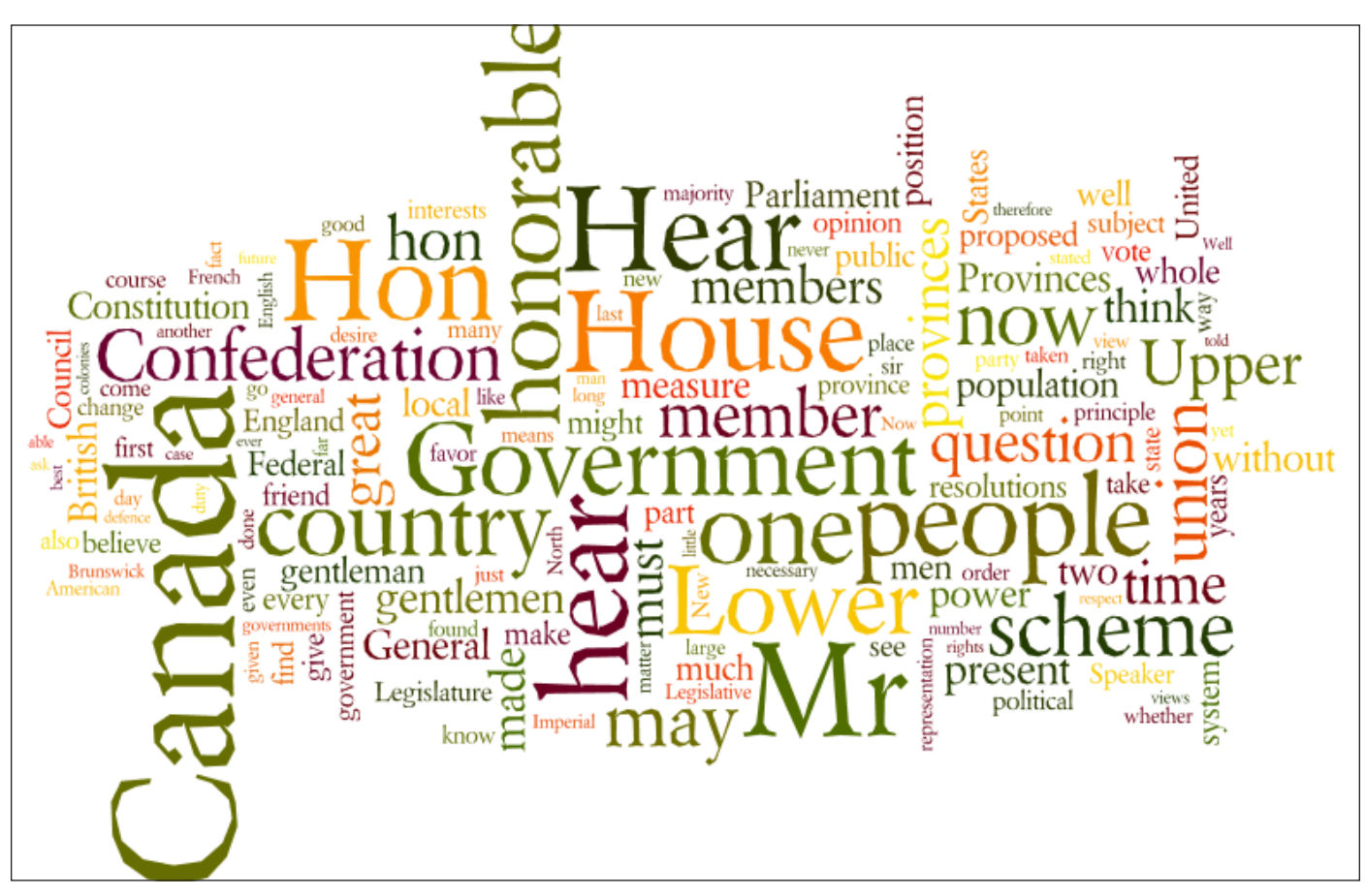
Wordle illustration of the most common words in the Confederation debates. The larger a word is, the more frequently it was used. The unabridged version of the debates was used in creating this Wordle.