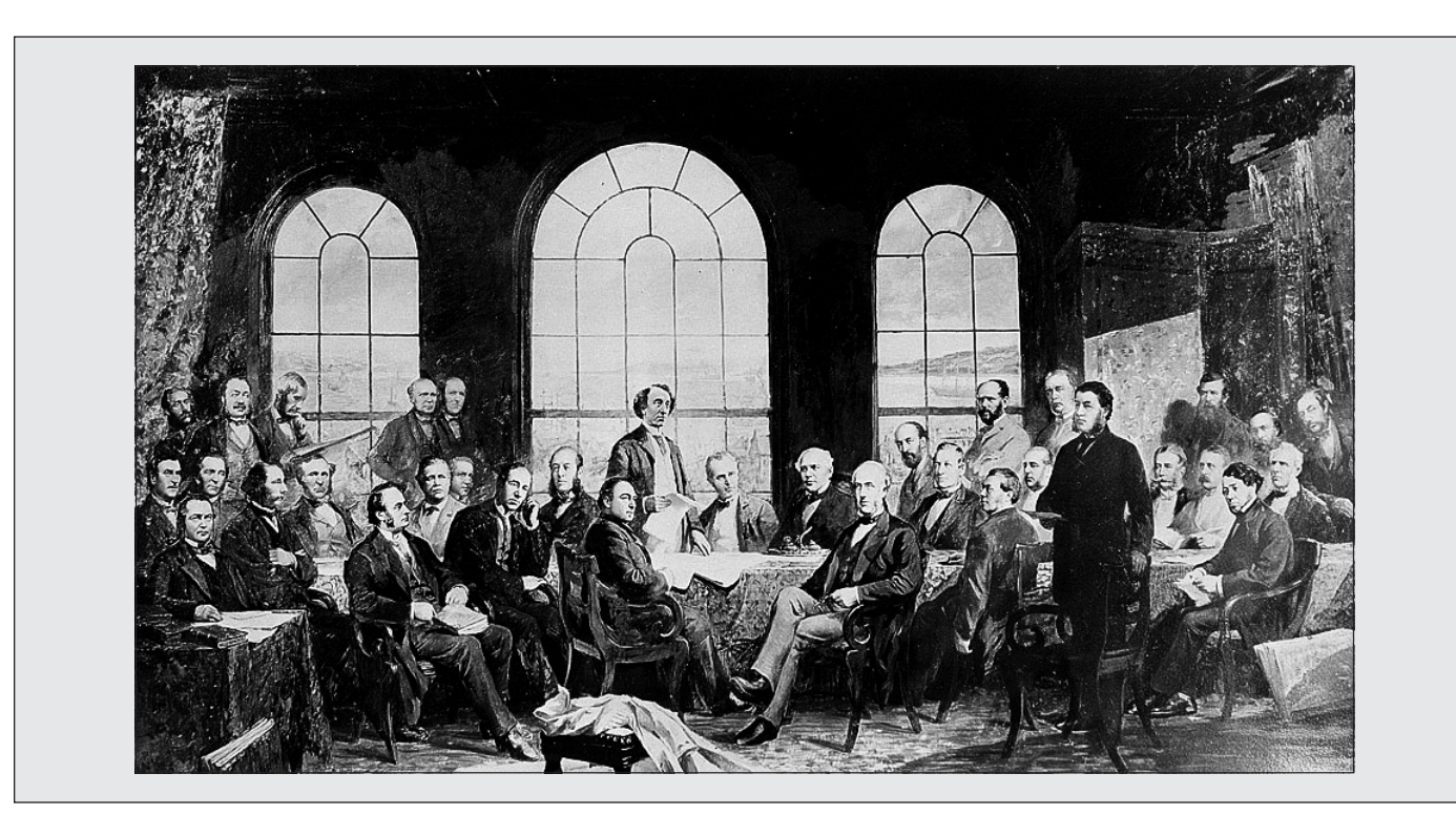
Photograph of 1884 Robert Harris painting.

The Robert Harris group portrait, page 42