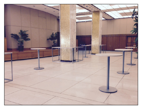
Inside the west side exhibition room.

solemn places, shells of a lost past. Often cash-strapped community organizations used to convene events free of charge in some of these spaces, but no more (Public Works and Government Services Canada 2015). In 2007, a World Book Day exhibit was held in what is now a sterile and dead room with fully stocked junk food machines. Today, only a small strip of the foyer holds archival installations. At the entry level of 395 Wellington, a prohibition on Library and Archives Canada signage is apparently in place. An old notice in the coatroom remains. It prophetically cautions patrons that the national archives will not be held responsible for valuables left behind.