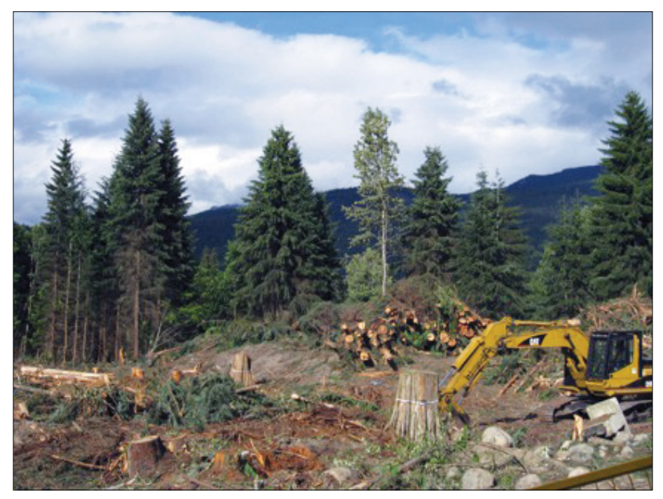
Logging in Canadian forests.

A massive scientific communications bureaucracy regularly intercepts journalists' requests for interviews with federal scientists working on "sensitive" issues like climate change, oil sands pollution, or the impacts of industry on biodiversity. Some requests are sent all the way up to the Office of the Privy Council, which reports directly to the prime minister. Scientists are being told